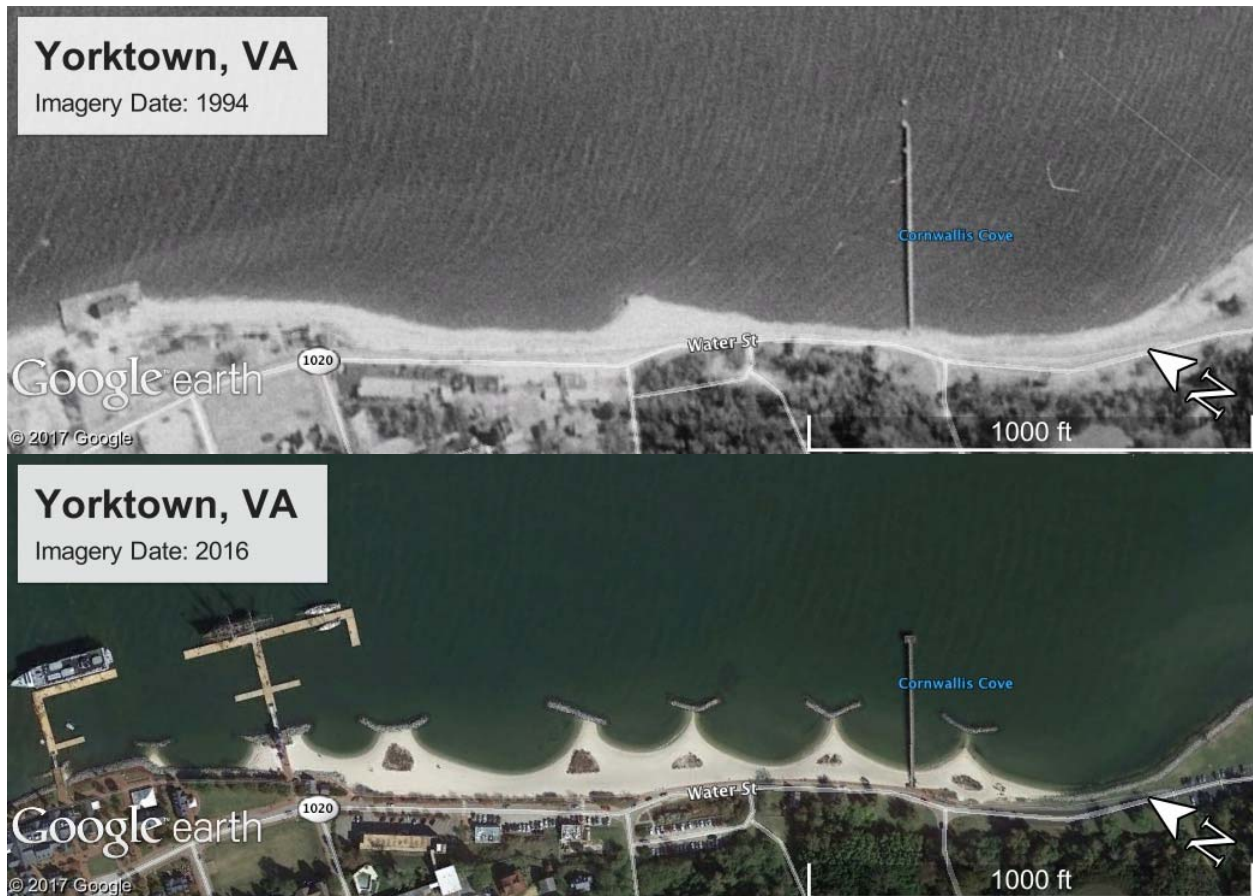
Figure 1. Pocket beaches along Water Street in Yorktown, VA (top panel, 1994; bottom panel, 2016).

The project has performed well by providing protection to the road, and the infrastructure behind the road, while also providing a sandy beach for tourists and locals for over two decades. The beach and vegetation provide intertidal habitat and shore bird habitat. Aside from flooding of Water Street during storms, which has been mitigated by a raised stone wall running parallel to the sidewalk, the road and sidewalks have not sustained damage from coastal storms (Milligan et al., 1996).