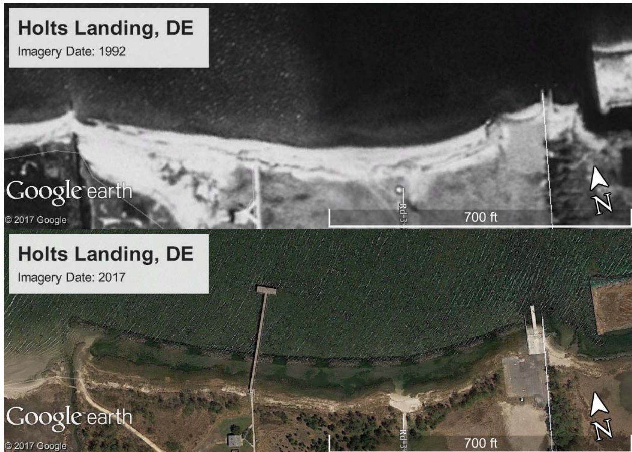
Figure 2. A series of offshore segmented breakwaters are used to attenuate wave energy to protect a constructed saltmarsh at Holts Landing, DE (top panel, 1992; bottom panel, 2017).

In 2005, the State of Delaware, Division of Parks and Recreation, Department of Natural Resources and Environmental Control (DNREC) built the offshore breakwaters in lieu of a bulkhead with the goal of creating wetland habitat while stabilizing the shoreline. The project protects approximately 1,000 feet of intertidal shoreline located 4 miles southwest of the Indian River Inlet. The offshore segmented breakwaters also attenuate wave energy when wind blows along the fetches, which vary from 2 miles to 4 miles. Pre- and post-construction photos are shown in Figure 2.